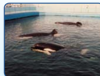
Tilikum, Haida, Nootka IV

Sealand of the Pacific - Victoria, BC / closed